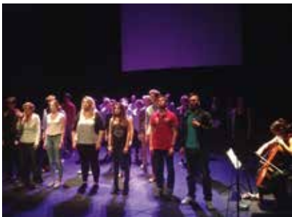
STD2A / Theatre