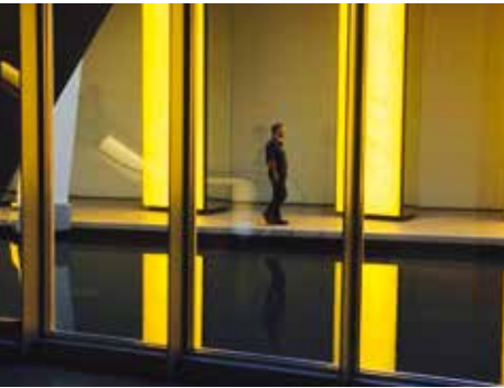
Visit of the Vuitton foundation by the ST2A (applied arts section, 11 th grade)

Accompaniments and activities dedicated to culture, arts and sports: photo workshop, comics, video, radio, music, manual creations, sewing workshop in English, going to movies or theatre, play chess, sign language, rugby, wrestling, Zumba, hip hop, futsal.