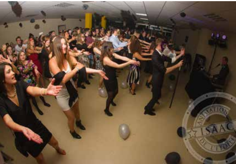
End of school-year party organized by the students' association (AEPiE)