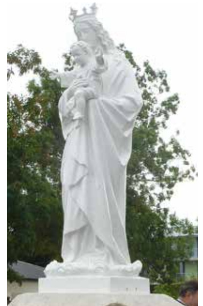
The Statue at Isaac