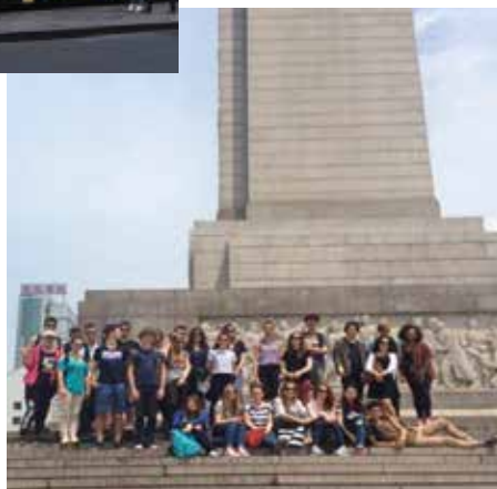
Trip to China