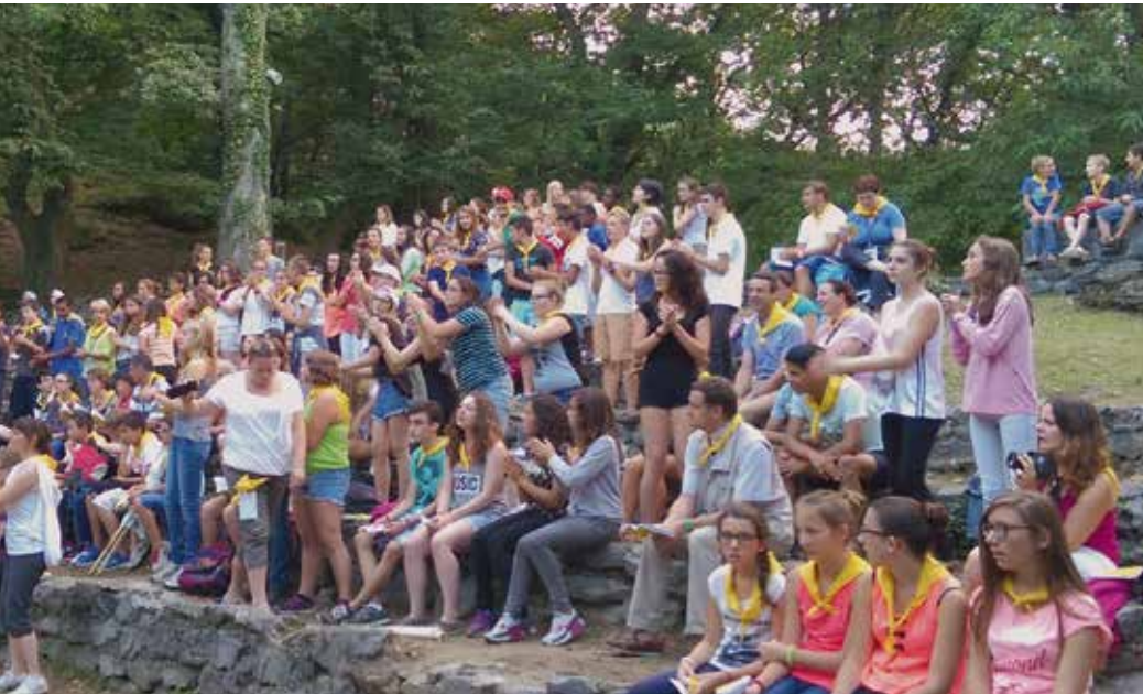
Youth pilgrimage to Lourdes