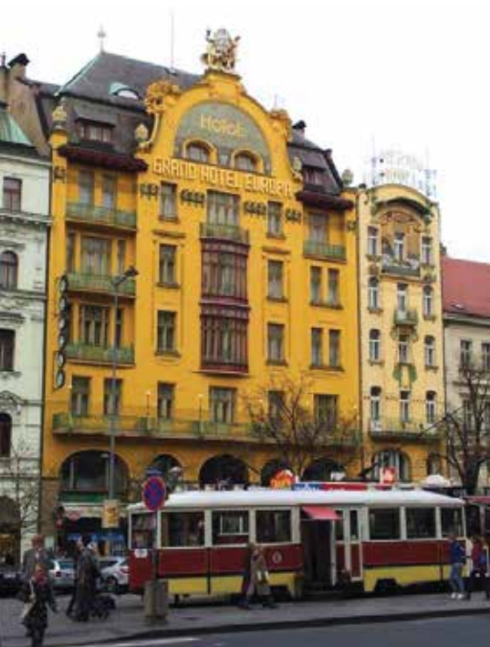
Trip to Prague